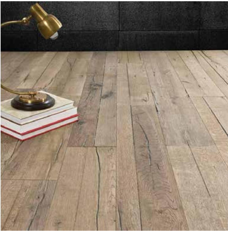
PH 42 Crack