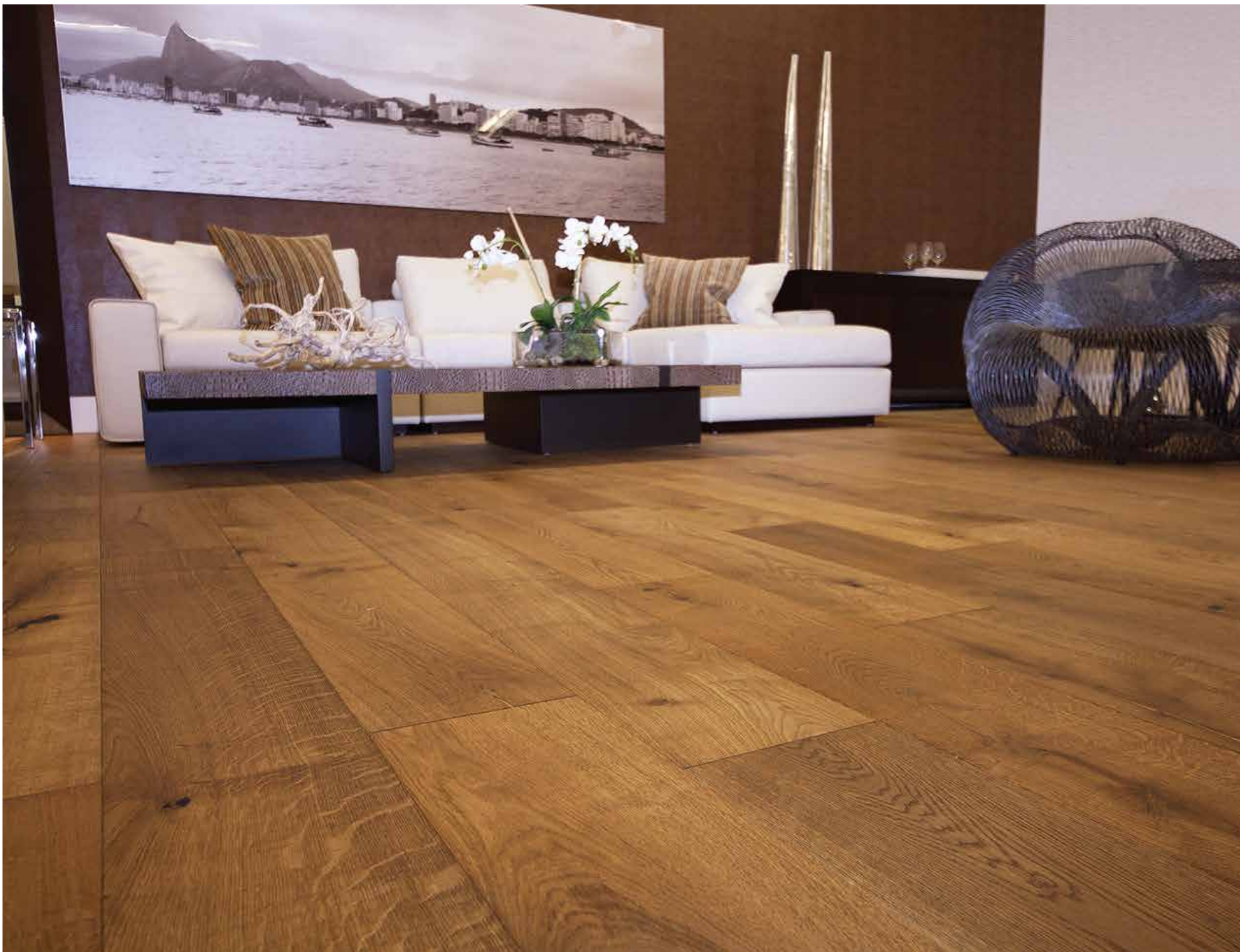
PH 24 Vintage