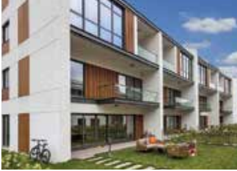
Siyahkalem Zekeriyaköy Village Project

Some of our customers for whom we have created 100% satisfaction.