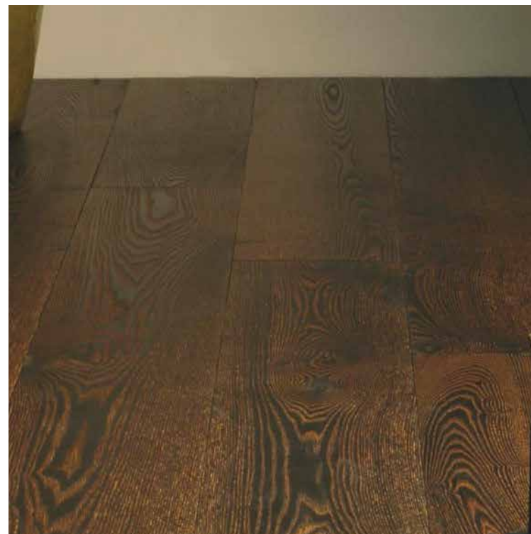
PH 50 Smoked