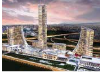
Metropol Ataşehir Ataşehir Project