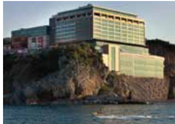
Dedeman Hotel Zonguldak