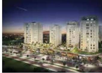
Banu Evleri Bahçeşehir