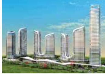
Iconova Gaziantep Gaziantep Project