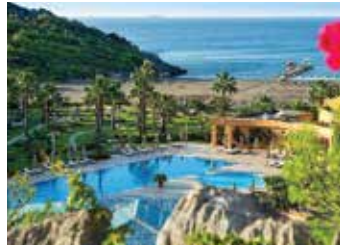
Robinson Club Sarıgerme