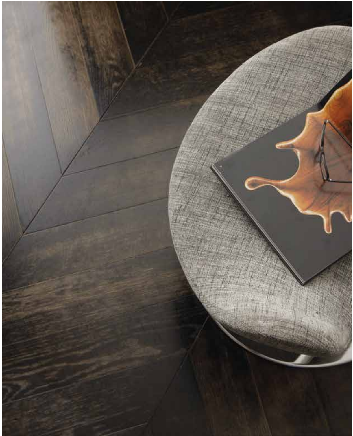
PH Macar / Chevron