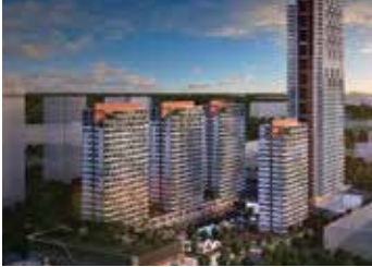
Babacan Yapı Crown Deluxe Bahçeşehir Project